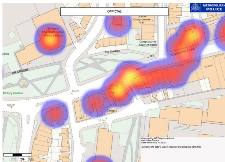
Violence against the person for the address and the immediate area. 05/03/2024- 06/03/2025.

The premises is presenting as a Police hotspot for Violence against the person, Criminal damage and Public order offences.